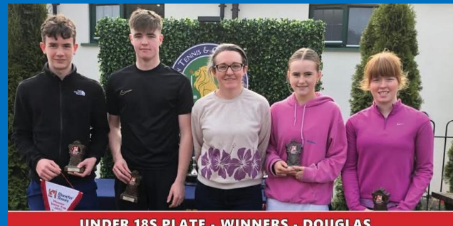
UNDER 18S PLATE - WINNERS - DOUGLAS

Congratulations to all our junior players, coaches, and their non-playing captains over the last number of months for all their hard work, commitment and dedication 🐧 We hope you all enjoyed the tournaments and games, we are so proud of you all representing Douglas.