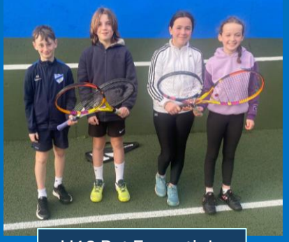
U12 Pet Essentials