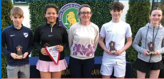
UNDER 14S PLATE - WINNERS - DOUGLAS