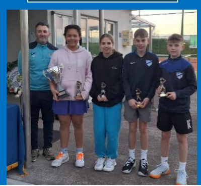
5 U14 MCAL Cup Winners